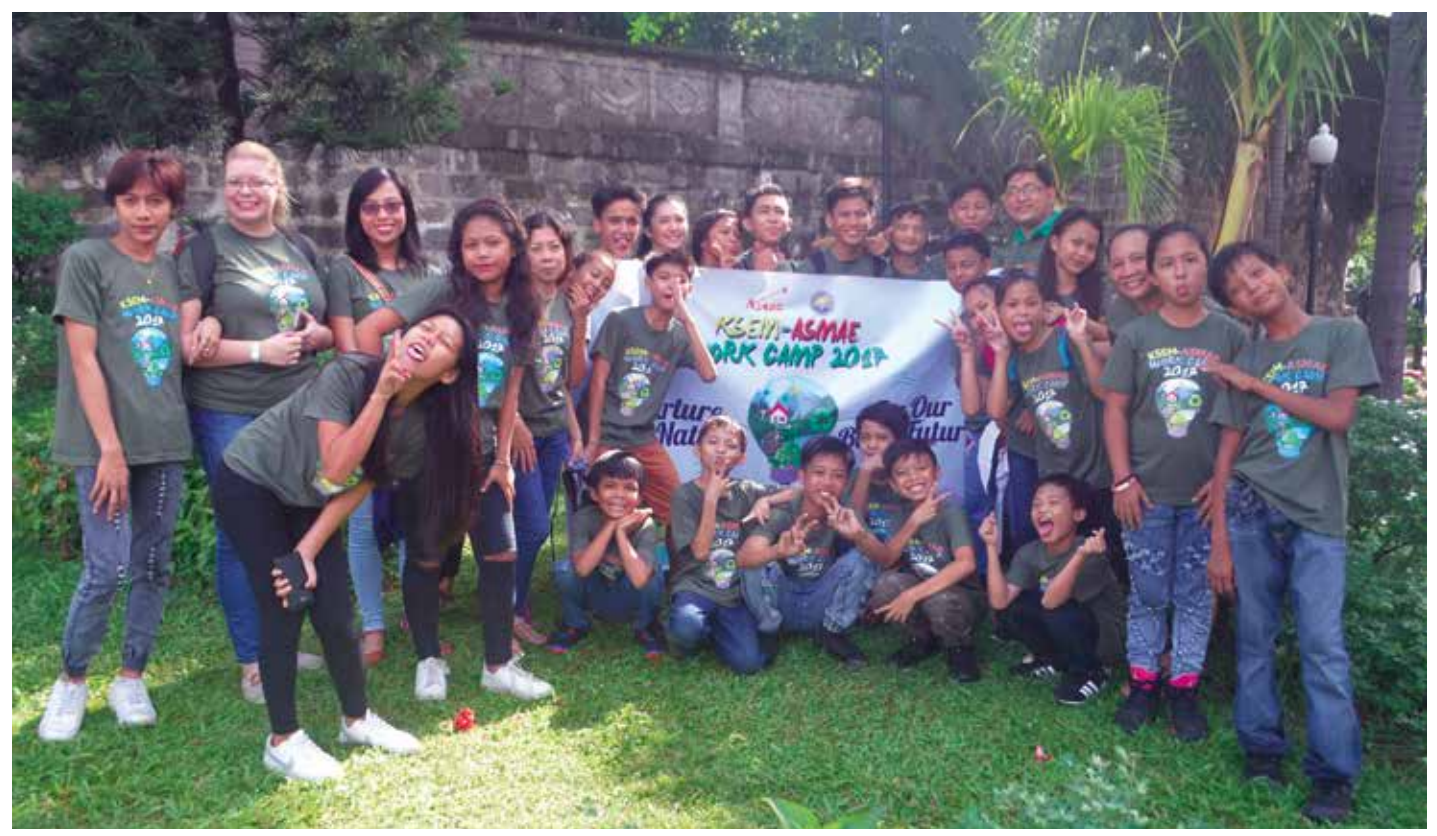
Child beneficiaries of the international solidarity camp in 2017, led by a volunteer appointed by Asmae.